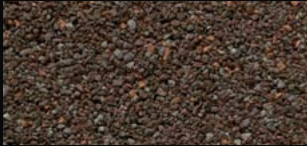
RUSTIC SLATE ●