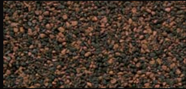
RUSTIC HICKORY ●◆