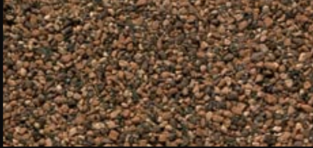
RUSTIC CEDAR ●◆