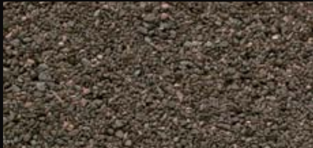
WEATHERED WOOD ●◆