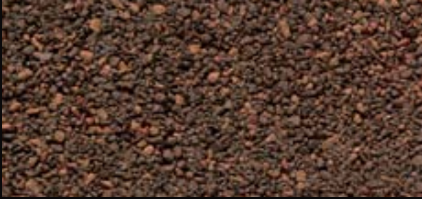
TWEED BLEND ●◆