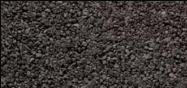
RUSTIC BLACK ●◆