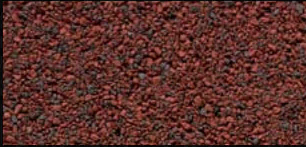
TILE RED BLEND ●