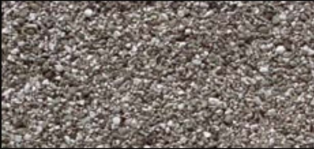
GREY BLEND ●