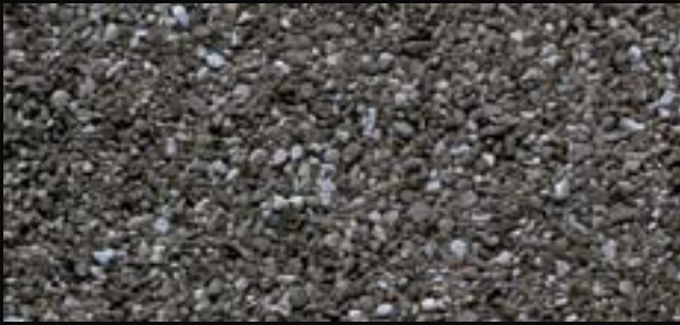
ANTIQUÉ SLATE ●◆