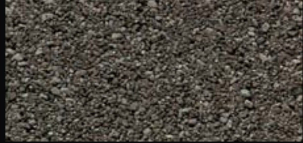
OXFORD GREY ●